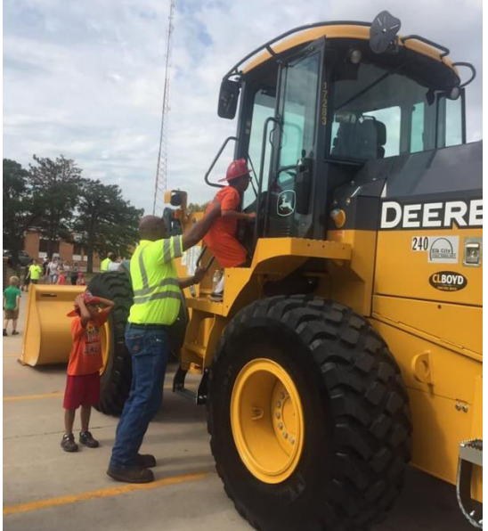
City Library's "Kids Touch a Truck" event.